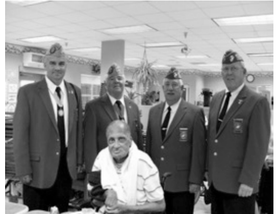
Visiting Marines in Hospitals and Nursing Homes