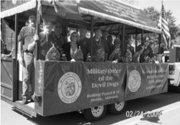
Participating in Parades and other events