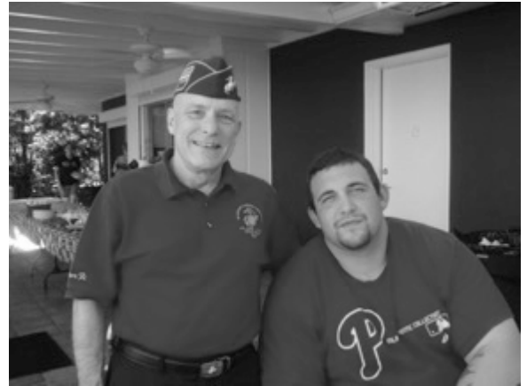
Putting on events to help our veterans