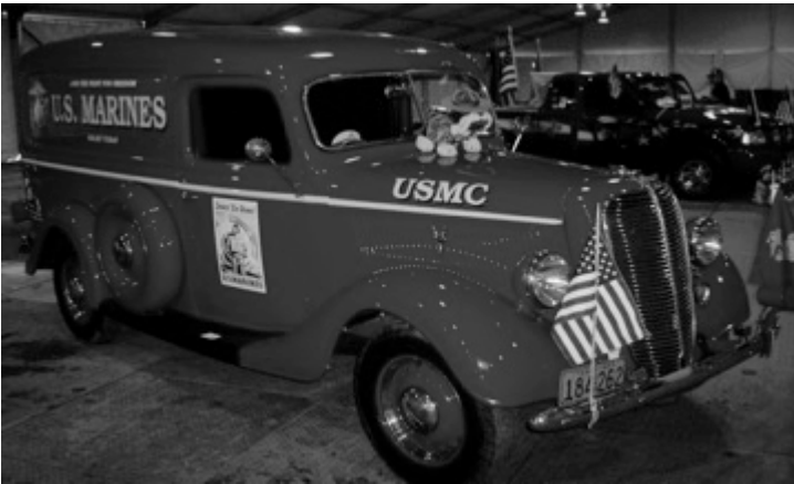
Showing our Colors